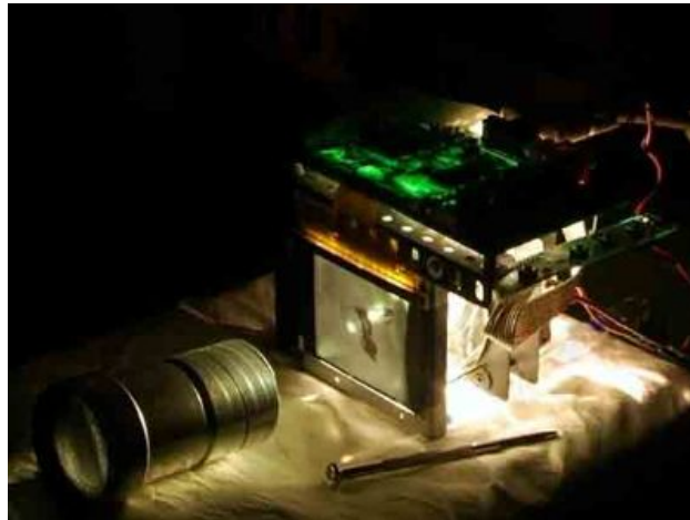
VOLATILES (VOADORES VOLÁTEIS) - visual installation

Bathed in an absolute clarity, the eye tries to distinguish one form, the ear demands an anchor point, the whole body prepares to for a symphony that will take place