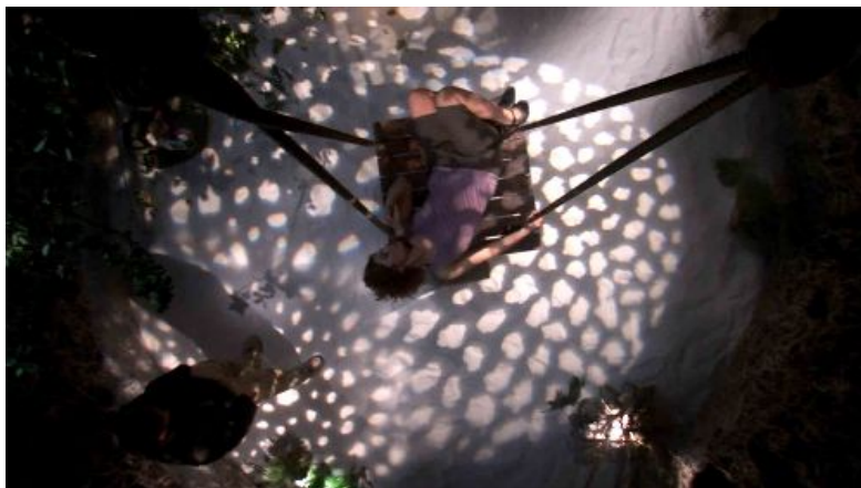
LA LISIÈRE Ficção - 18' - colour - 2009..

Lucille, 11, lives in a swimming complex of which the parents are in charge. This strange place is like a flying saucer, it brings out an irrepressible anguish and obscurity. The unidentified object of their disorder will prove to be even more obsessive than the terrors of childhood.