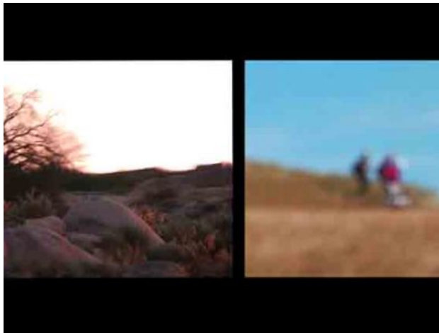
RECOMBINANT LANDSCAPE - video installation

Two landscapes are offered simultaneously to contemplation. The public makes its acquisition by combining them mentally, then after finding a visual interface that merge into a single landscape.