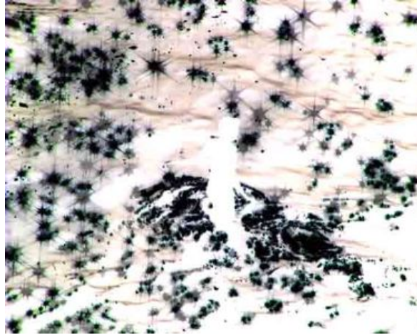
OCÉANIDES - video installation

Bathed in an absolute clarity, the eye tries to distinguish one form, the ear demands an anchor point, the whole body prepares to for a symphony that will take place