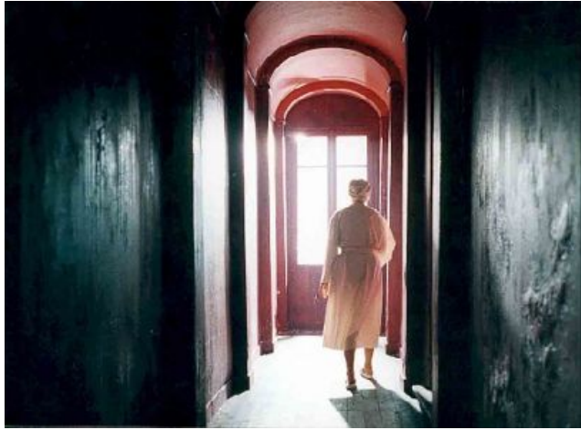
EN MON SEIN Fiction - 17'46" - 35mm / colour - 2003

Hermelin, a spirited teenager, goes on holiday to the seaside home of his grandmother Elise, a disturbed sexagenarian beauty vivacious but dry as a bone. A beautiful family house is home to the love of Hermelin, his lover of 35 years, Luca. Elise stands as a spectator of this summer adventure with the implicit consent of their granddaughter, haloed with grace and sensuality of youth, offering a sublime vision of herself as the incarnation of the impossible mourning of femininity.